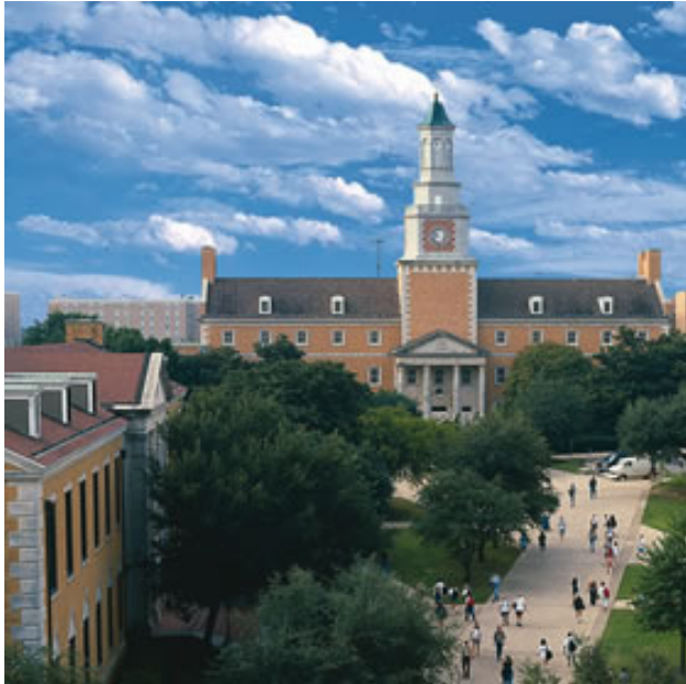
University of North Texas

important part of UNT's value system: "It will be our aim to become leaders in the education of the young men and women of Texas, fitting them to creditably fill the most important positions in business and professional circles. We desire the cooperation of all who believe in higher education and who want to see our state in the very front of intellectual as well as material progress."