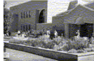
Eagle Student Services Center