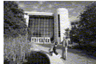
Environmental Education, Science and Technology Building