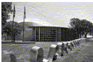
Murchison Performing Arts Center