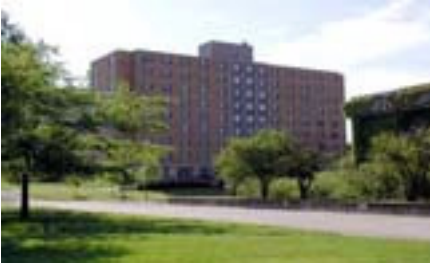
Hart Hall Global Living and Learning Center