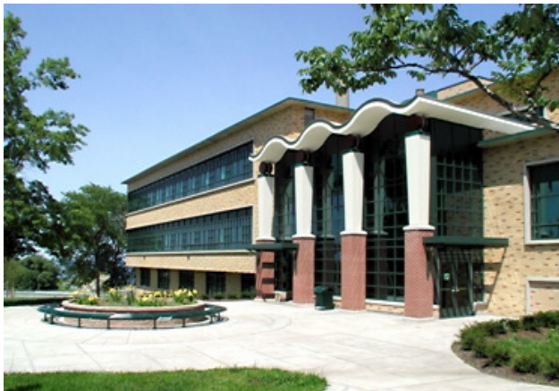
School of Business

At SUNY Oswego, we foster liberal and professional learning in a dynamic, interactive and supportive environment. SUNY Oswego offers an opportunity for students to pursue unlimited horizons. With a student body of 8,500 learners, we are large enough to offer more than 100 programs of study yet small enough for students to form quality relationships with each other and caring faculty.