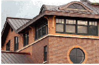
Johnson Hall First Year Residence Hall