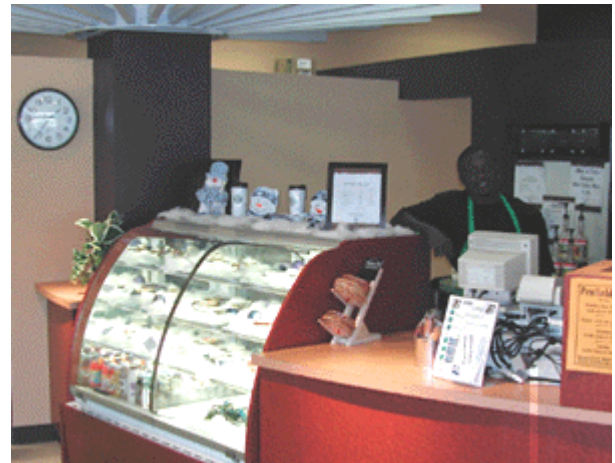
The Lake Effect Café