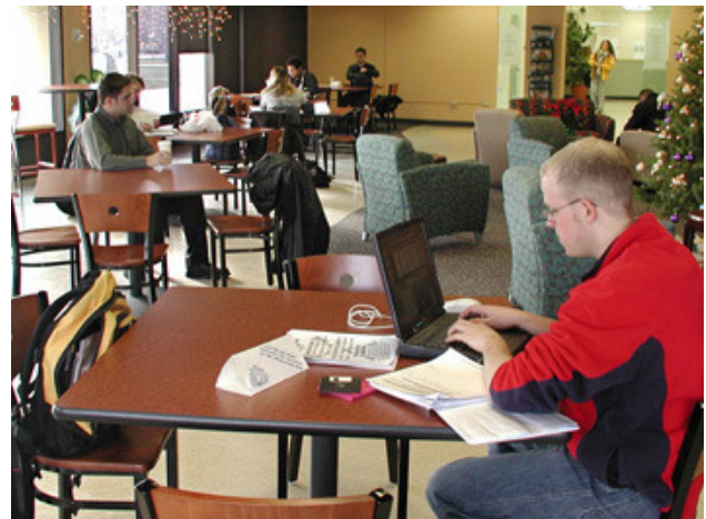
Use Laptops in the Café