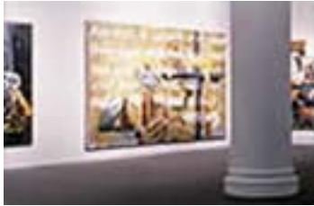
BU Art Gallery

Boston is rich in history, old-world charm, and modern vitality. Home to more than 60 colleges and universities, it is an intellectual and cultural center diverse in its people and stimulating in its opportunities, yet relaxed and accessible.