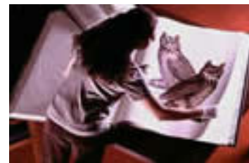
Aububon Folio-Special Collections

Boston University is perfectly situated to enjoy both the charm and beauty of the city and its cultural and recreational attractions. The campus stretches along the banks of the Charles River, bringing boating, canoeing, jogging, and sunning to its doorstep; yet it is only minutes from the downtown theatre, shopping, government, and financial districts. A short ride on the streetcar brings one to the elegant shops of Copley Square, the sporting events at the Fleet Center, or the endless diversions of the restored Faneuil Hall Market Place. The city's rich cultural and ethnic mix is evident in its varied neighborhoods. The North End boasts superb Italian cuisine, Chinatown has a wealth of restaurants, and smaller enclaves offer Portuguese, Indian, Thai, Vietnamese, Middle Eastern, Jewish, and soul food. These cuisines are, of course, in addition to world-class pizza, tacos, and other fast foods necessary to student survival.