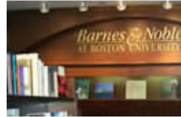
Barnes & Noble at BU

Boston is the largest city in New England and the site of many significant events in early American Colonial and Revolutionary history. Much of that early flavor remains today in its cobbled streets, in its historic landmarks that bring alive Paul Revere's ride and the Boston Tea Party, and in the Federalist row houses on Beacon Hill. A historic seaport that grew to prominence in the days of the China trade and the whaling industry, the city maintains a thriving and picturesque waterfront. The New England Aquarium, one of the foremost in the world, shares the harborside with sightseeing cruise ships, traditional New England fishermen unloading their catches, international cargo traffic, and the U.S.S. Constitution, "Old Ironsides." Here, historic treasures intermingle with contemporary skyscrapers, evidence of the city's thriving business and financial community and its leading role in research and technology.