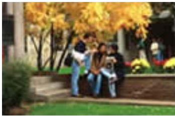
Bay State Road

Boston is rich in history, old-world charm, and modern vitality. Home to more than 60 colleges and universities, it is an intellectual and cultural center diverse in its people and stimulating in its opportunities, yet relaxed and accessible.