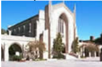
Daniel L. Marsh Chapel

Boston is the largest city in New England and the site of many significant events in early American Colonial and Revolutionary history. Much of that early flavor remains today in its cobbled streets, in its historic landmarks that bring alive Paul Revere's ride and the Boston Tea Party, and in the Federalist row houses on Beacon Hill. A historic seaport that grew to prominence in the days of the China trade and the whaling industry, the city maintains a thriving and picturesque waterfront. The New England Aquarium, one of the foremost in the world, shares the harborside with sightseeing cruise ships, traditional New England fishermen unloading their catches, international cargo traffic, and the U.S.S. Constitution, "Old Ironsides." Here, historic treasures intermingle with contemporary skyscrapers, evidence of the city's thriving business and financial community and its leading role in research and technology.